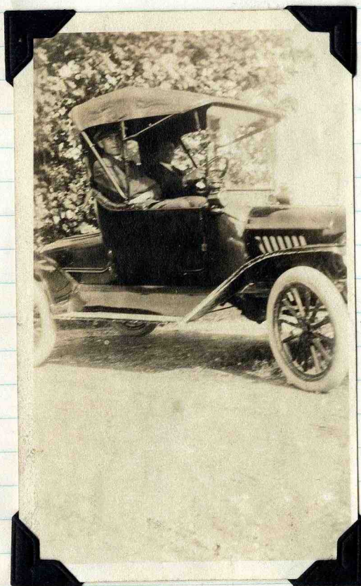
First Ford coupe.