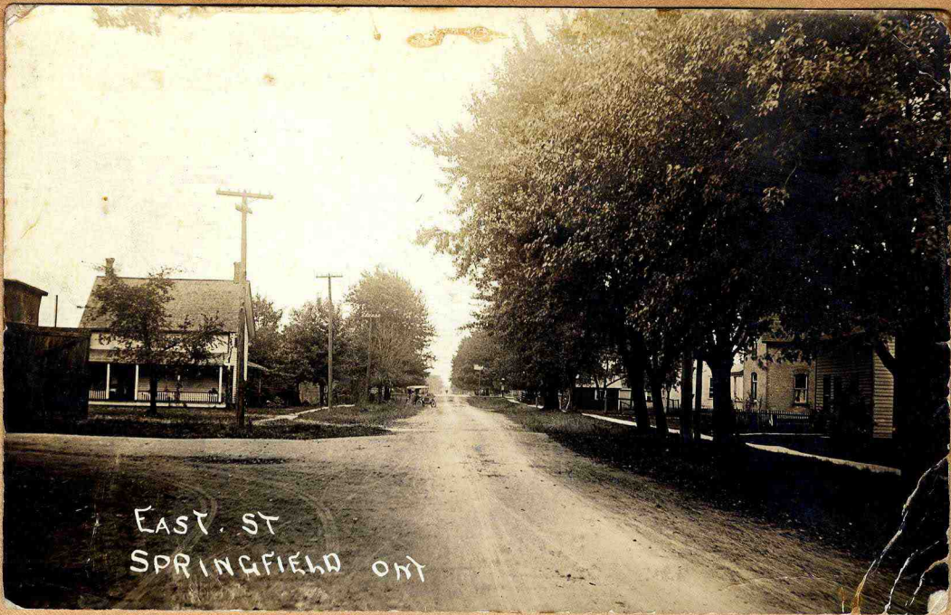
EAST ST SPRINGFIELD ONT