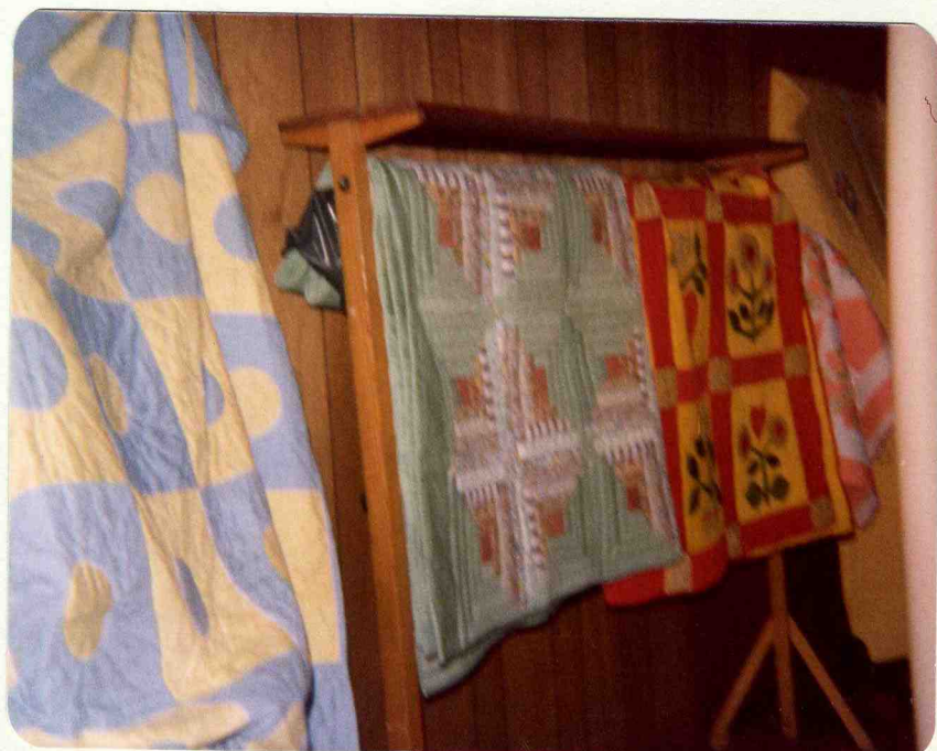
QUILTS on DISPLAY 1981.