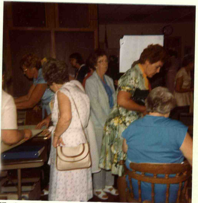
AT LONDON AREA TWEEDSMUIR WORKSHOP