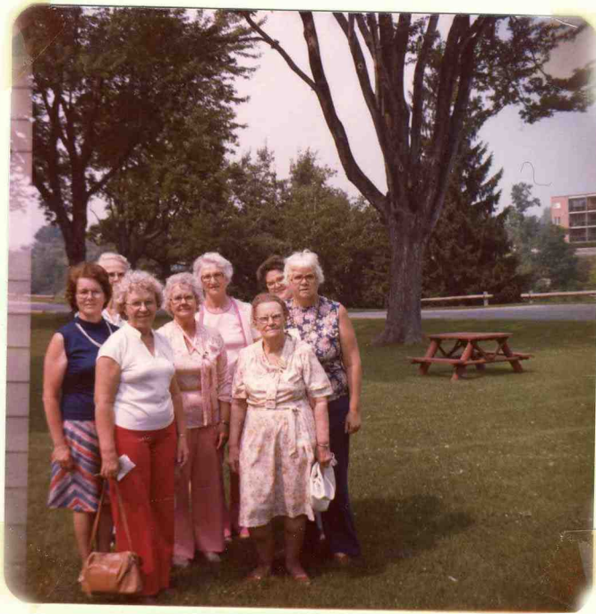
PICNIC WITH CRINAN W.I.