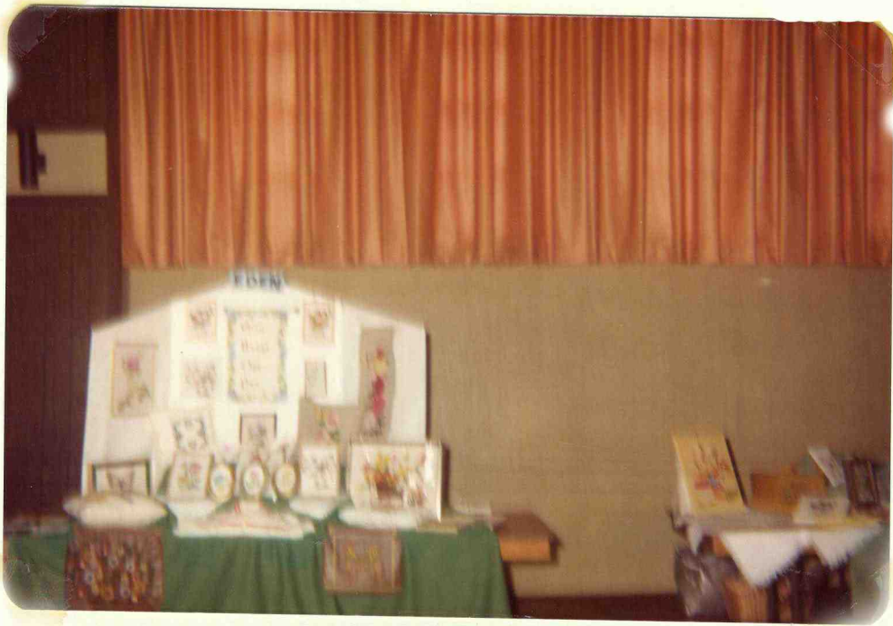
EXHIBIT CREWE & COURSE - 1980