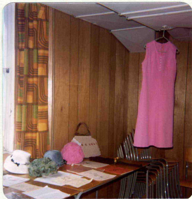
ITEMS FROM COURSES ON DISPLAY

Other courses taken include Accessories for the home, Focus on finishes, Safety is a family affair, Safety in the home, Hats for you, Felcraft, Interfacings, Fibres for fabrics, When you bake with yeast, Let's bake bread, Spotlight on bread, Baked in a pie, The main dish makes the meal, furniture facts, Crewel embroidery, Ontario fruit, Desserts, Christmas cookies + candies, 143 lbs of meat, Dressmaking with a difference, Salute to vegetables, vegetables with a flair, the car with a story, Home Canning, Quilting, The club girl entertains, clothes for leisure, 4H Home garden club, Taking a look at yourself, A world of food in Canada, The knack of sewing with knits, Creative block printing, sportswear from knits, Accessories for the bedroom, Items of interest to the homemaker, The jacket dress, The third meal, focus on fitness, needlecraft, sleeping garments and Garden beautification. Some of these were for the 4H girls, some were for H.S. members and other women of the area. All were enjoyed and greatly appreciated by the women and girls who were able to take them.