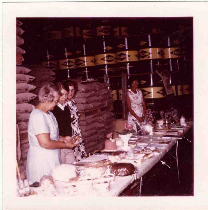
Bazaar table at BARBEQUE