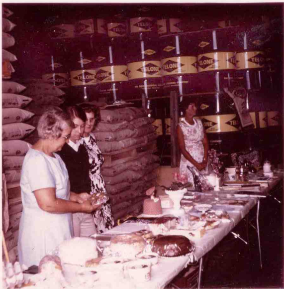
Bazaar table at rainy day BARBEQUE