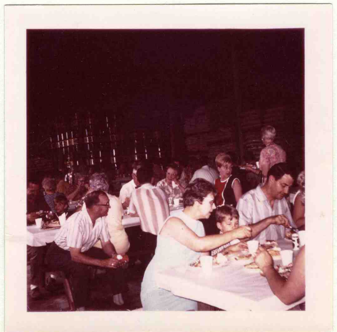
Enjoying the good food.