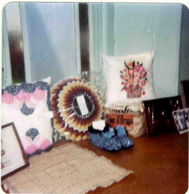
CRAFTS ON DISPLAY