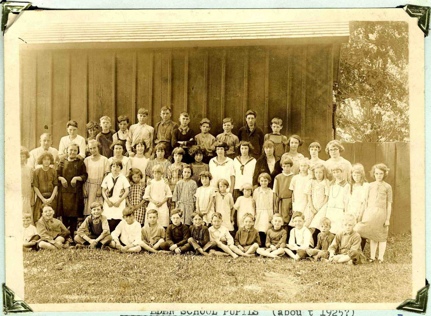
EDEN SCHOOL PUPILS (about 1925?)