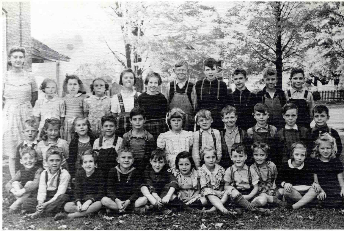
SOME OF EDEN PUBLIC SCHOOL PUPILS OF THE JR. ROOM.