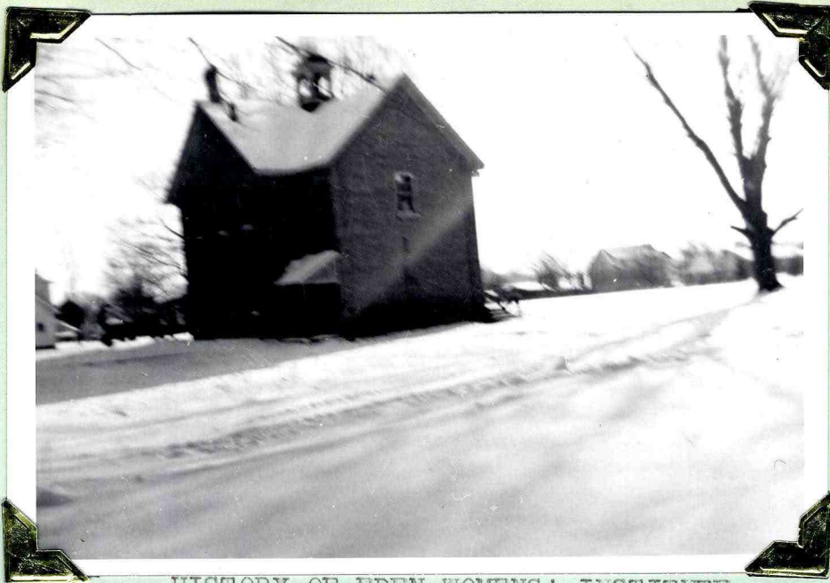
HISTORY OF EDEN WOMENS' INSTITUTE.