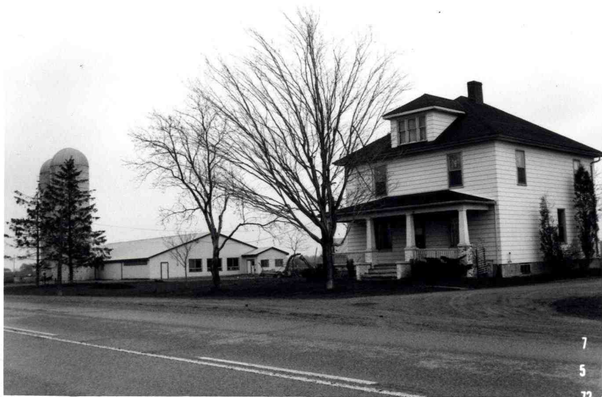
The Pieter DeWitt farm in 1972

completely different style of barn, without a loft for hay, storing most of his feed in silos. He installed a modern milking parlour and milks a herd of nearly fifty cows.