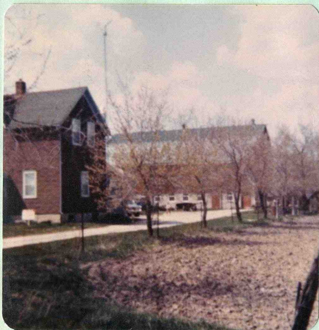
Same home & bldgs BUT - Years later