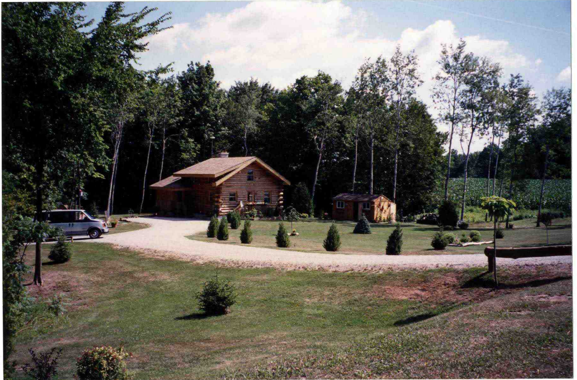
Heat Conserving Style - Concession 5 Malahide

Log Cabin - moved to this sight in sections and put together on the sight -