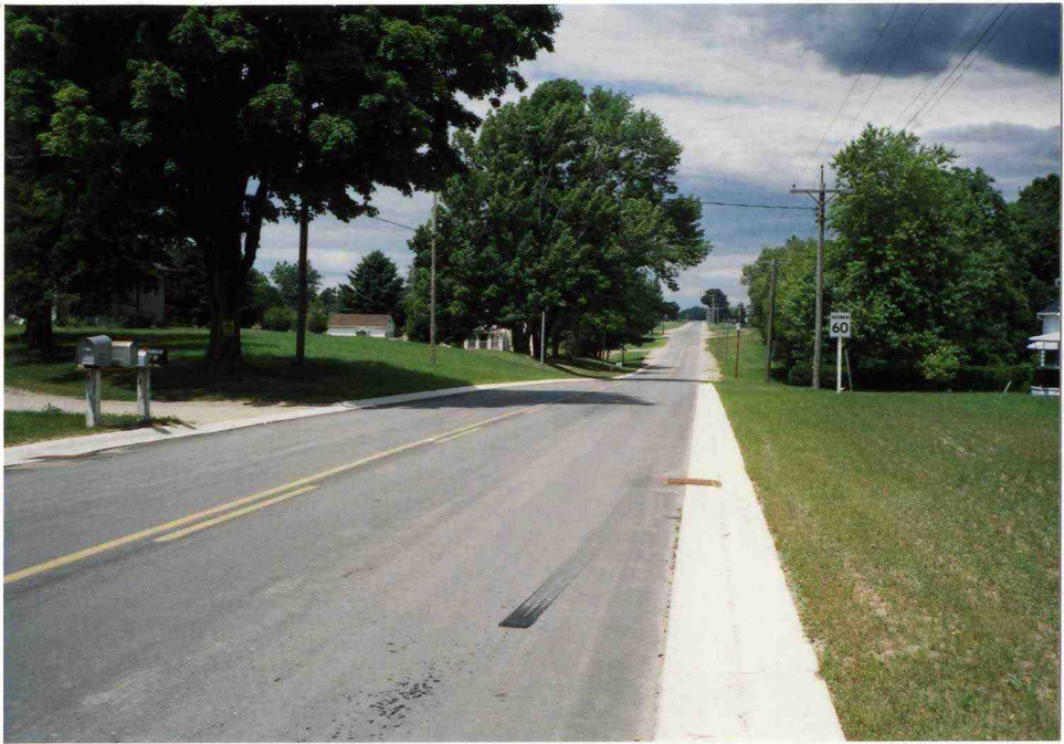
TOWN LINE - NORTH FROM CALTON INTERSECTION