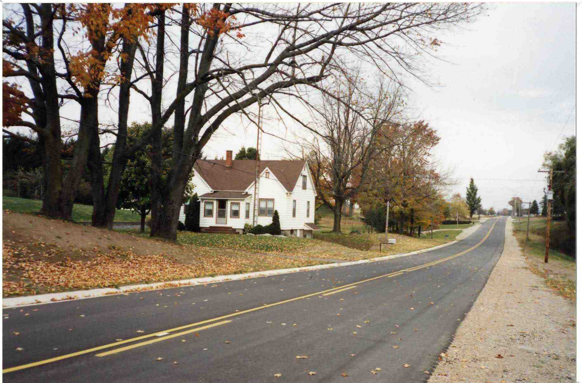
1991-05-07 COMPLETED ROAD AT WOLFE HOME