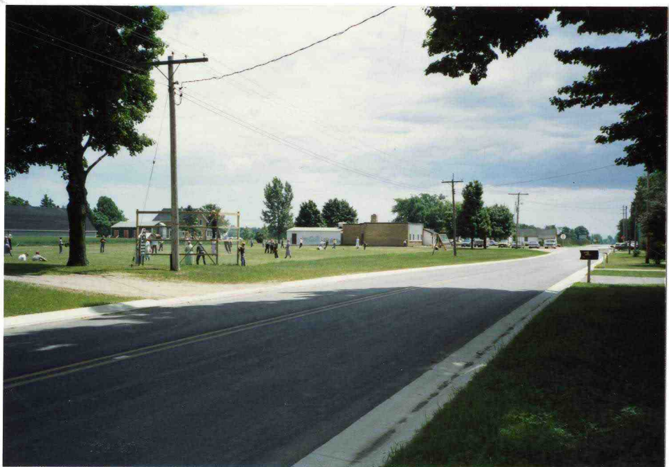
SOUTH - MENNONITE SCHOOL & GENERAL STORE