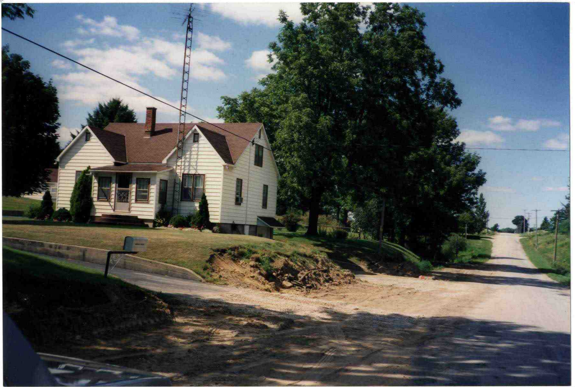
MURRAY & RUTH WOLFE HOME. LAWN IS TORN AWAY FOR CONSTRUCTION OF NEW ROAD