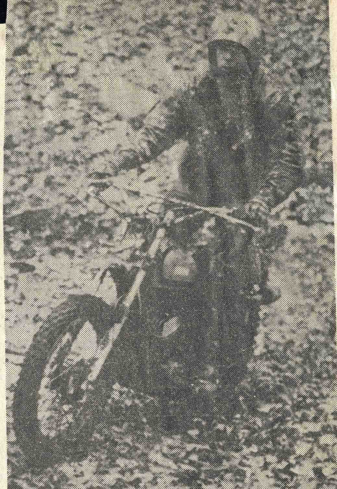
ENDURANCE RUN — Already spattered with mud, this unidentified motorcycle rider makes his way through a gully near the beginning of a 50-mile endurance run sponsored by the Otter Valley Motorcycle Riders, held near Calton, Sunday. The route took the riders south from Calton to the lakeshore, and then in a loop to return to their starting point, one mile north of Calton. Thirty-seven of the 109 riders entered finished the run.