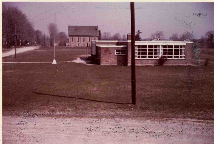
School and Church.