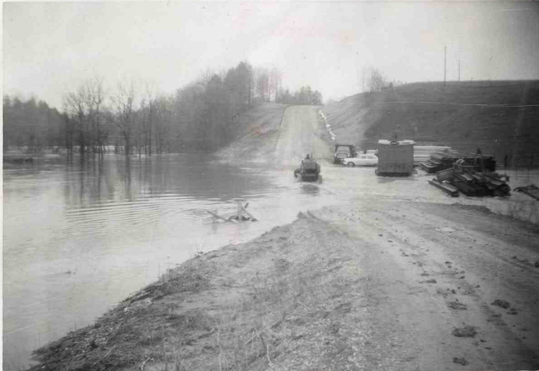
Spring flood - 1960 Otter Creek down at bridge.