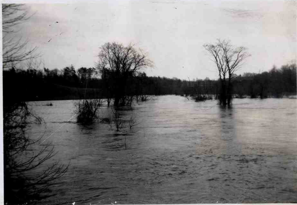
Cartwright Hills Spring 1947.